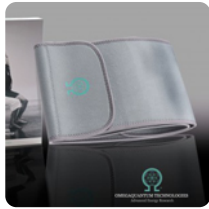
Pain Aid Pad

Click on the image to order the Pain Aid Pad