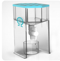
CO2 Capture Kit

Click on the image to order the Pain Aid Pad